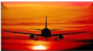
Travel Supply Chain