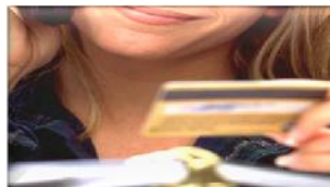
Mobility Management & Card systems