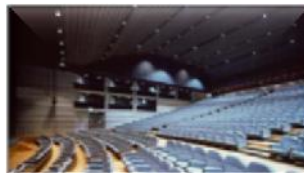
Congresses & events